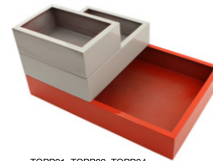
TOPP01, TOPP02, TOPP04