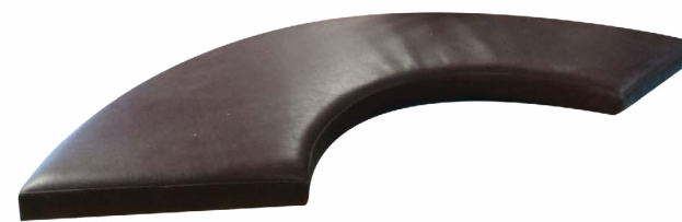
Upholstery 72° Cushion