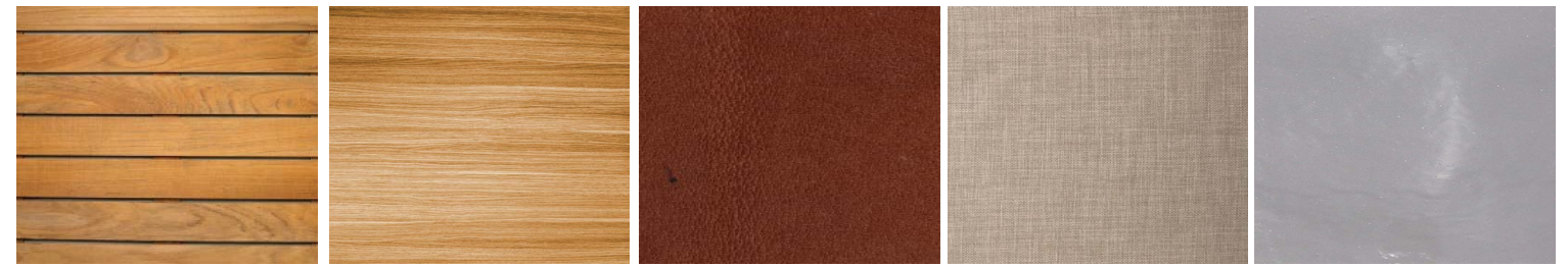
Slated Wood Solid Wood Leather Upholstery GRP Fibreglass