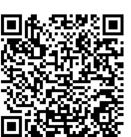
Scan to view product online